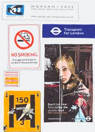
+ Larissa Fassler, Regent Street Regent's Park (Dickens thought it looked like a racetrack), detail, 2009. Deutsche Bank Collection. © Larissa Fassler. Courtesy SEPTEMBER, Berlin